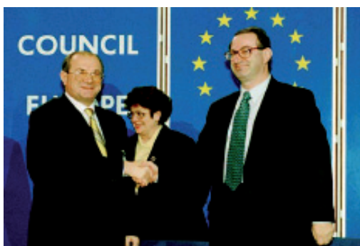
Mr. Mate Granić, Minister of Foreign Affairs of the Republic of Croatia and Mr. Daniel Tarschys, the Secretary - General of the Council of Europe