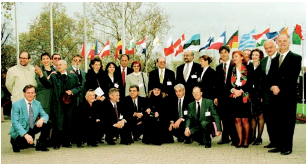
The Croatian delegation