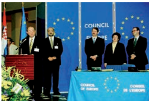
The speech by Mr. Mate Granić, Minister of Foreign Affairs of the Republic of Croatia