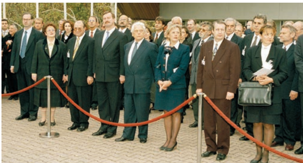
The accession ceremony of the Republic of Croatia to the Council of Europe