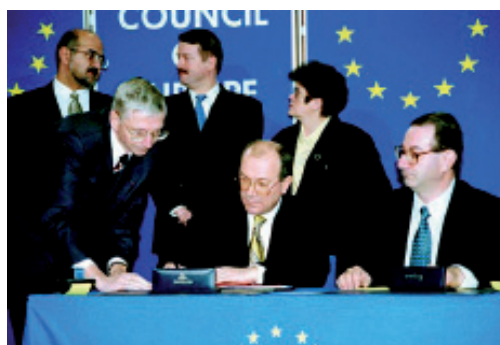
Mr. Mate Granić, Minister of Foreign Affairs of the Republic of Croatia signs the Statute of the Council of Europe, together with Mr. Daniel Tarschys, the Secretary-General of the Council of Europe