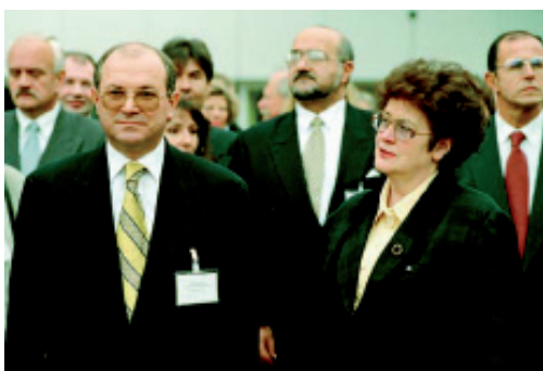
Mr. Mate Granić, Minister of Foreign Affairs of the Republic of Croatia, together with Leni Fischer, the President of the Parliamentary Assembly