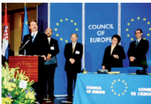
The speech by Siim Kallas, Minister of Foreign Affairs of the Republic of Estonia and Chairman of the Committee of Ministers of the Council of Europe