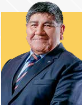
Rómulo Mucho Former Minister of Energy and Mines