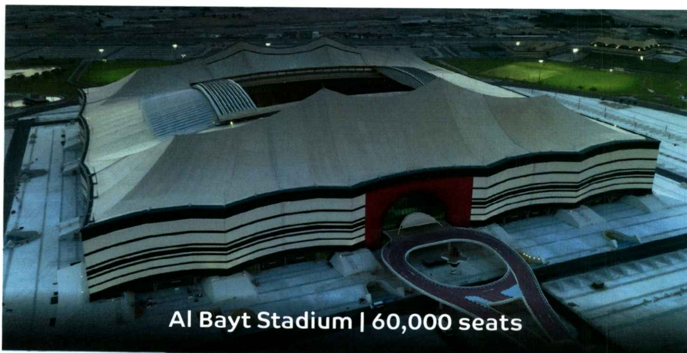
Al Bayt Stadium | 60,000 seats