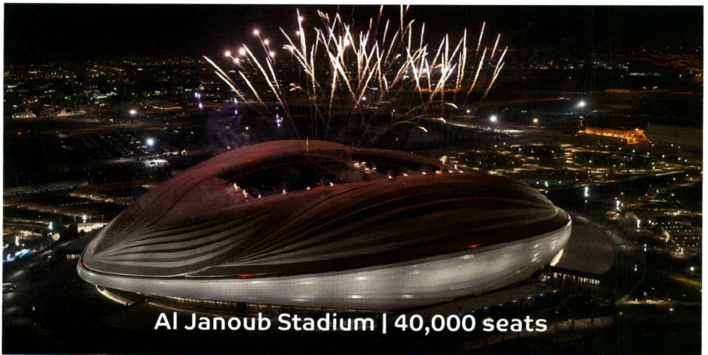
Al Janoub Stadium | 40,000 seats