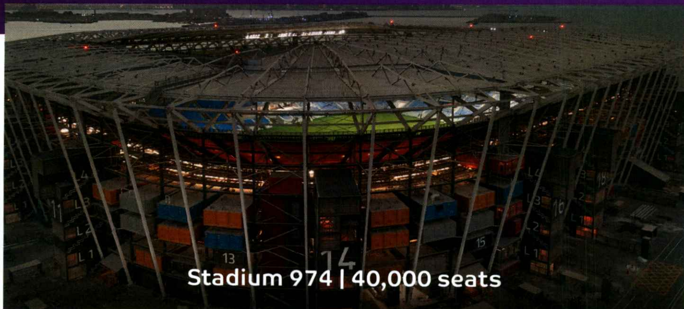
Stadium 974 | 40,000 seats