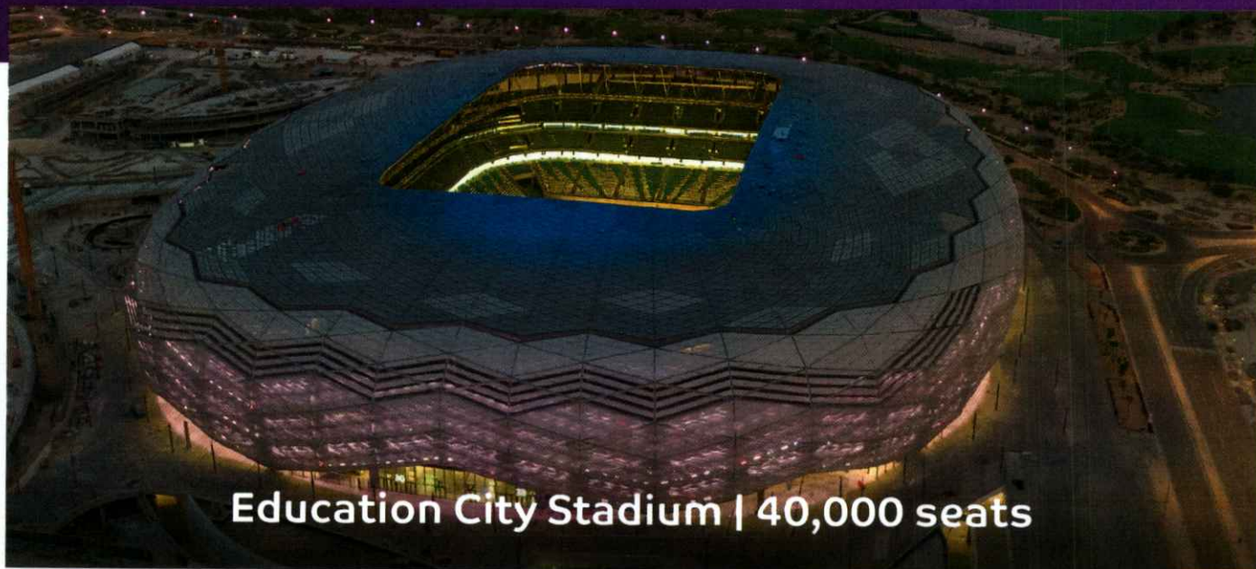
Education City Stadium | 40,000 seats