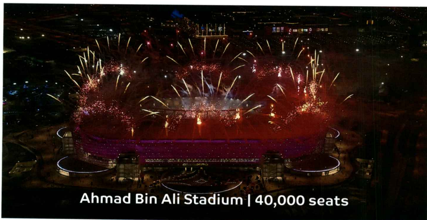
Ahmad Bin Ali Stadium | 40,000 seats