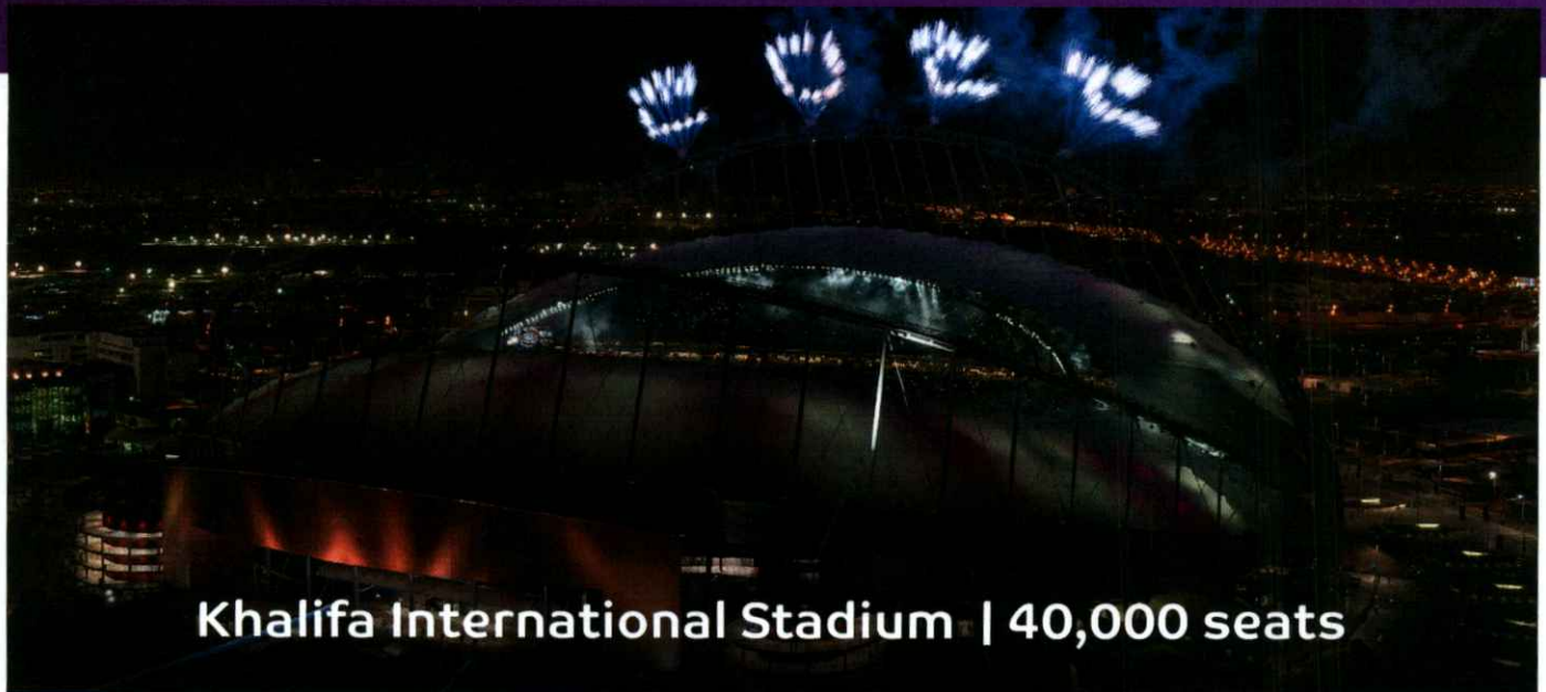
Khalifa International Stadium | 40,000 seats