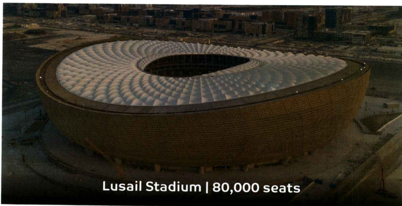
Lusail Stadium | 80,000 seats