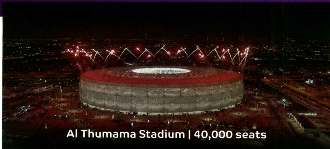
Al Thumama Stadium | 40,000 seats