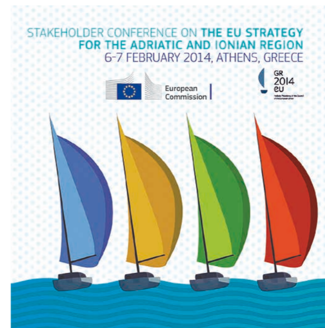
Stakeholder Conference on the EU Strategy for the Adriatic and Ionian Region, Athens, 6-7 February 2014

Combined with other actions, the objective is to create further opportunities for smart, sustainable